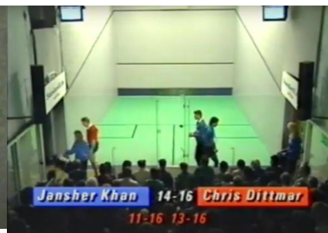
1989 Telesquash Final, Chris Dittmar V Jansher Khan. Dittmar wins 16/14, 16/11, 16/13. Court 7 fitted with 80 tiered seats and hinged glass back walls folded back (BBC TV clip)