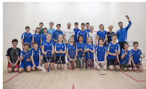
2016 – Gregory Gaultier master classes