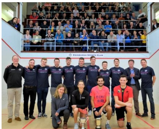
2020 – Karim Abdel Gawad