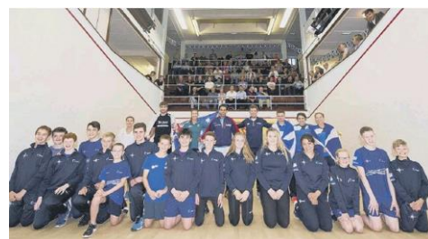
2018 Aug - Mohamed El Shorbagy at ESC – demonstration matches